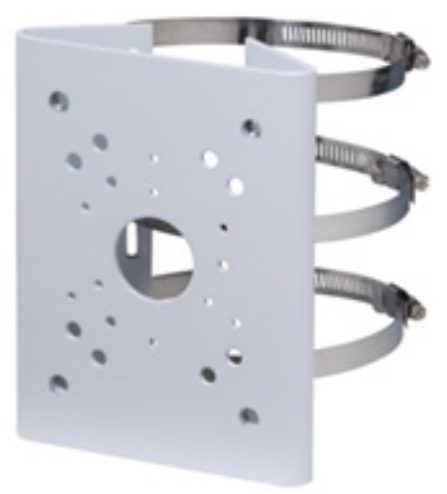
(b) Corrosion-resistant pole mount