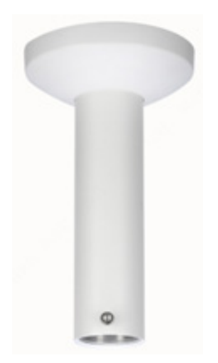
(a) Corrosion-resistant ceiling mount bracket

Dahua provides the following corrosion-resistant brackets: