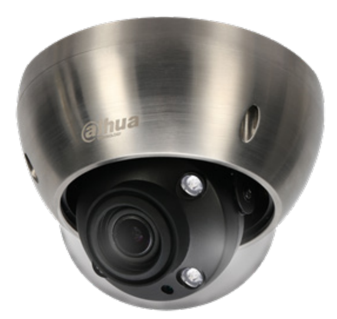
Figure 3.3 Dahua SUS 316L stainless steel corrosion-resistant product