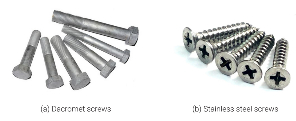
Figure 3.4 Two screw types