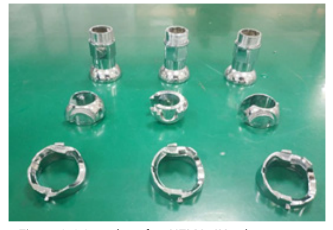
Figure 3.6 Samples after NEMA-4X salt spray test

Figure 3.6 shows the results of scandium aluminum samples after performing the NEMA-4X salt spray test. The samples show no sign of corrosion and are bright and clean. The overall structure passes the IP67, IK10, vibration test, drop test, and other reliability tests.