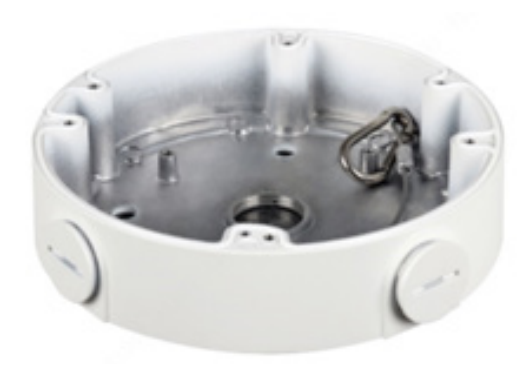
(d) Corrosion-resistant junction box