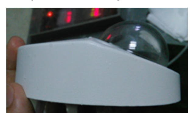
Figure 3.1 Corrosion-resistant effect comparison

Compared with other corrosion-resistant processes such as powder coating or micro-arc oxidation plus powder coating, Dahua corrosion-resistant technology of high performance anti-corrosive aluminum plus high performance anti-corrosive coating has the following advantages: